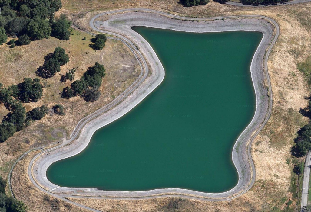
Ocean View Pond, 5 acres, 1.7 MW